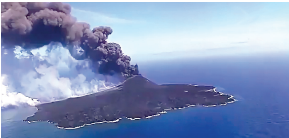
Japan's remote Nishinoshima volcano has spewed huge amounts of lava and ash during recent weeks.

Volcanologists say there is a lot more magma rising beneath the volcano, meaning it is likely to grow larger.