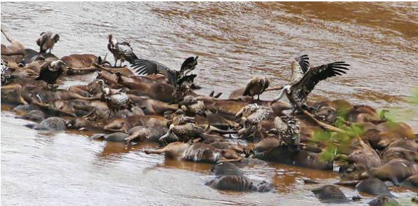
Vultures feed on the carcasses of hundreds of wildebeests that drowned in the Kenyan portion of Mara River.