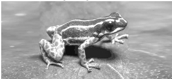
This tiny but exquisite new-to-science frog species was found in a remote Brazilian rainforest.

Unlike larger, high-profile wildlife crimes, insect smuggling is harder to detect and is often overlooked by law enforcement despite its global reach.