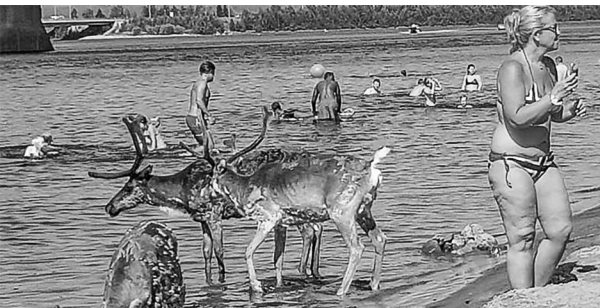
Wild reindeer take a dip amid humans in northern Finland to escape the record heat wave baking much of Scandinavia.

Scientists warn that repeated bleaching events are occurring too frequently for the reef to recover, with the system becoming increasingly unstable.