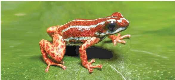
This tiny but exquisite new-to-science frog species was found in a remote Brazilian rainforest.

Unlike larger, high-profile wildlife crimes, insect smuggling is harder to detect and is often overlooked by law enforcement despite its global reach.