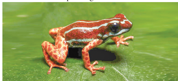
This tiny but exquisite new-to-science frog species was found in a remote Brazilian rainforest.

Unlike larger, high-profile wildlife crimes, insect smuggling is harder to detect and is often overlooked by law enforcement despite its global reach.