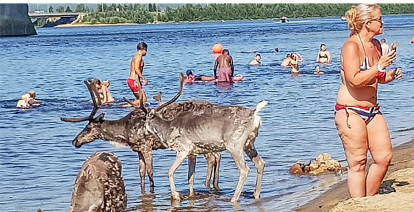
Wild reindeer take a dip amid humans in northern Finland to escape the record heat wave baking much of Scandinavia.

Scientists warn that repeated bleaching events are occurring too frequently for the reef to recover, with the system becoming increasingly unstable.