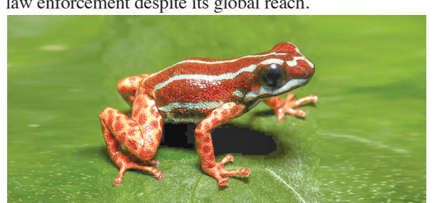
This tiny but exquisite new-to-science frog species was found in

Unlike larger, high-profile wildlife crimes, insect smuggling is harder to detect and is often overlooked by law enforcement despite its global reach.