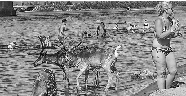
Wild reindeer take a dip amid humans in northern Finland to escape the record heat wave baking much of Scandinavia.

Scientists warn that repeated bleaching events are occurring too frequently for the reef to recover, with the system becoming increasingly unstable.