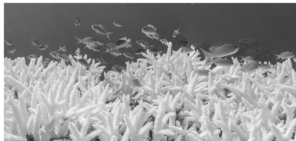
Global heating is pushing coral reefs toward the worst worldwide coral bleaching on record.

The global bleaching started last year in the Florida Keys when water there became as warm as a hot tub. It then spread to the Southern Hemisphere and now affects more than half of the world’s coral.